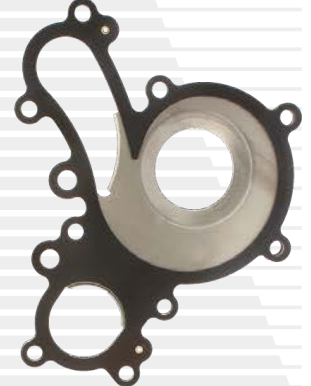
Multi-Layer Metal w/ Integrated Water Channel NBR Coating