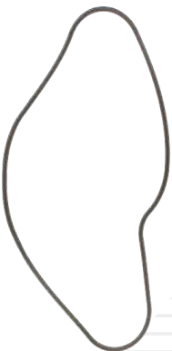
Water Channel O-Ring

*Scan QR code 2 to watch Water Pump Gasket Video.