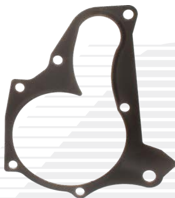
Beaded Metal w/ Nitrile (NBR) Coating