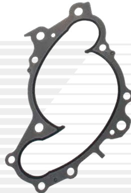
Metal Shim w/ Integrated NBR Coating